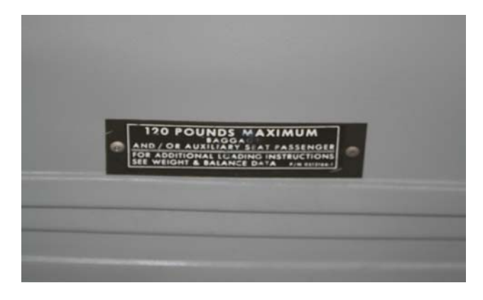
We found, among other things, that the installer used an automotive radiator hose and clamps for the filler . Additionally, the installer failed to change the baggage weight placard that would have been part of the STC

requirements. The owner of the aircraft said the aux tank had been installed since he had owned the aircraft. The A&P/IA that performed the last annual was interviewed or interrogated depending on who you ask. He admitted to having performed the last 15 annual inspections and that the tank had always been there. He assumed it was a factory installation because the illustrated parts catalog shows a similar installation.